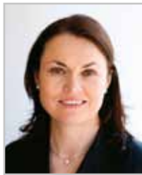
FIONA O'CARROLL Independent News & Media